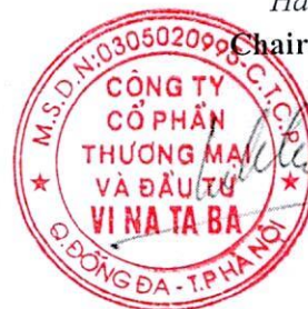
LE CHI LONG