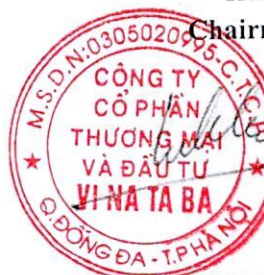
LE CHI LONG